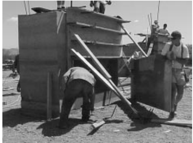
Stripping forms from Gila house.

As series of collaborations, this architectural practice has provided the basis for classroom learning, experiential learning, service learning, and rigorous research for all parties involved.