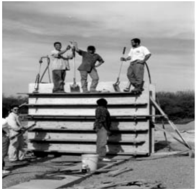
Setting formwork for Gila River residence.