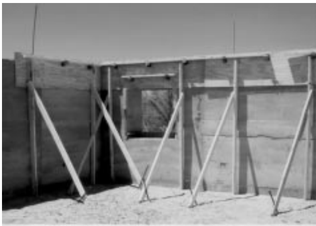
Forming for bond beam of Gila house.