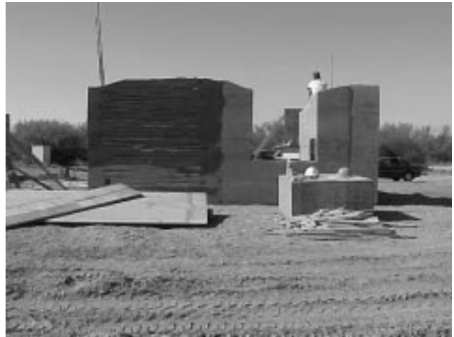
Massive walls of Gila residence take shape.