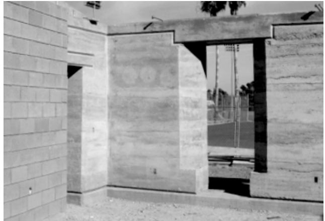
Completed wall showing chamfers and reveals.