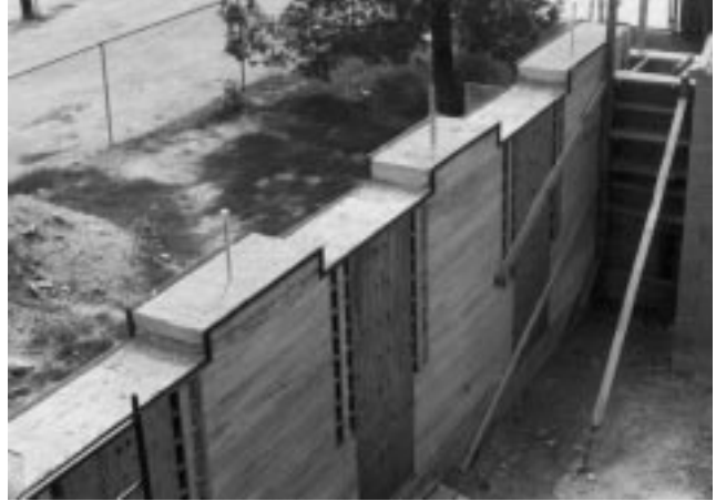
Rammed earth walls under construction for classroom facility.

Even as students shaped the classroom facility, the faculty began to realize the implications of the new forming system in the impoverished communities of the region. One Design/Build professor wrote a grant proposal for an educational partnership between the College of Architecture and a Native American community that was in dire need of additional housing. The Gila River Indian community had rejected government built housing that bore no affinity for their traditional building methods, and the tribal Housing Committee was enthused